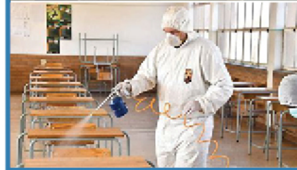
The tragic failure of the City’s public health policy

in America — 300,000 people live here, and our workday population swells to 500,000. We are fortunate to have outstanding, world-class institutions in Irvine, including UCI and major biomedical corporations. Yet, our Mayor and City Council have completely failed to organize these community partners to develop a clear, coordinated strategy to protect Irvine residents and workers from contracting and spreading COVID-19.