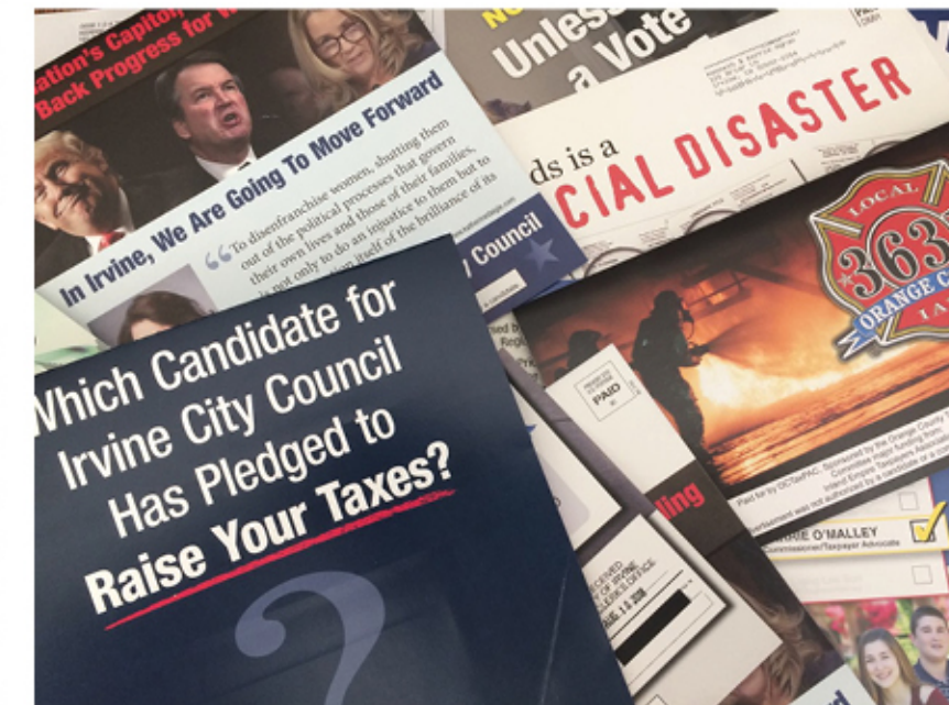
Dark money mail from the 2018 Irvine City election

Answer: No. In fact, in the current race for Mayor and City Council, a number of good candidates run their campaigns the old-fashioned way, staying within the strict campaign contribution limits prescribed by the City of Irvine — limiting what an individual donor can give to just $530 per candidate for Mayor or City Council. Here, below, is a side-by-side listing of leading candidates for Mayor and City Council. The candidates in the left column are “clean money” candidates — they don’t take dark-money help in their campaigns. The candidates in the right column are “dark money” candidates — they do take dark money in their campaigns. And lots of it!